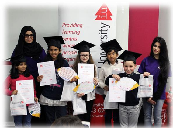
Students graduating with our City University Ambassadors